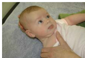
Stretching exercises are often very effective and should be done at home after instruction