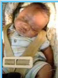
Child with a left sided torticollis

Torticollis refers to a posture in which the child's head is tilted to one side and rotated to the opposite side. Torticollis is most often the result of tightening of one or more neck muscles.